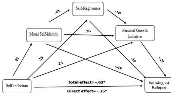
Figure 2. Serial mediating role of self-importance of moral identity, self-forgiveness, and personal growth initiative on self-reflection and warning of relapse among drug addicts.

Table 4 shows the indirect effects of the mediators for the predicting warning of relapse. Results demonstrate that all three mediators; self-importance of moral identity (M 1 ), self-forgiveness (M 2 ), and personal growth initiative (M 3 ) have significant effect and thus mediate between the predictor that is; self-reflection (X) and outcome that is; warning of relapse (Y) which for current study is interpreted in terms of the relapse prevention among the drug addicts such that higher the warning of relapse lower the respective relapse prevention.