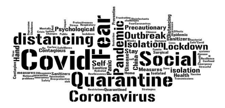
Figure 1 Most Frequently Used Words by the Participants to Describe Their Lived Experiences During the First Wave of COVID-19

The seventh and last category in the data was the linguistic new normal. The word cloud in figure 1 is an illustration of how the selected newspapers' reporting on the virus took over the participants' lives. It is evident from figure 1, table 1 and excerpts in that new words, e.g., war rhetoric, adjective phrase, adverbs to mitigate the verb (action), negation markers, medical terms, were overwhelmingly used by journalists and borrowed by the participants which expressed fear and social exclusion. Figure 1 shows lexicons, such as COVID-19, social-distancing, fear, and panic, among others, in descending order that overwhelmed the participants' narratives. It is evident from their responses that the language used to report about COVID-19 forced them to borrow certain expressions to describe the frightening implications of the virus. The words that were seeded into their heads contributed to the discourse of fear and a generalization that the Chinese might be behind the virus's spread. The use of the word 'China' in the literature on COVID-19, although small, perpetuated anti-Chinese sentiments. To further our investigation, the next section specifically explores the literature covering anti-Chinese sentiments.